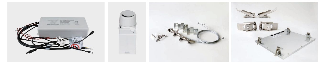
External Emergency driver for Europe Triac Dimmer Suspending Kits Recessed installation dips