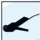
Plate spring: it is made of the superior stainless steel, with strong elasticity, accurate bending angle and corrosion resistance, which is not easy to damage and is high in use security.

Power line: silica gel is used externally, and it has the joint lock ring design which is easy for installation and disassembly. Pure copper core line is used internally, which has a small resistance, with resistance to bend, flame retardancy, and resistance to high temperature and aging.