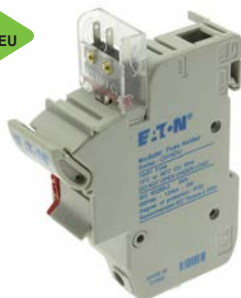
Shown with optional microswitch