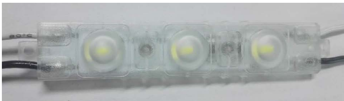
FIG 1 HHX-75123-J56T