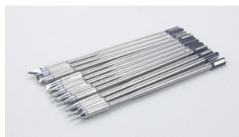
Note: Integrated heater details in page 8–9.