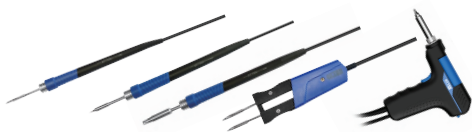
Note: GT series optional handles details in page 7.