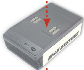
ALL-100A Base Unit